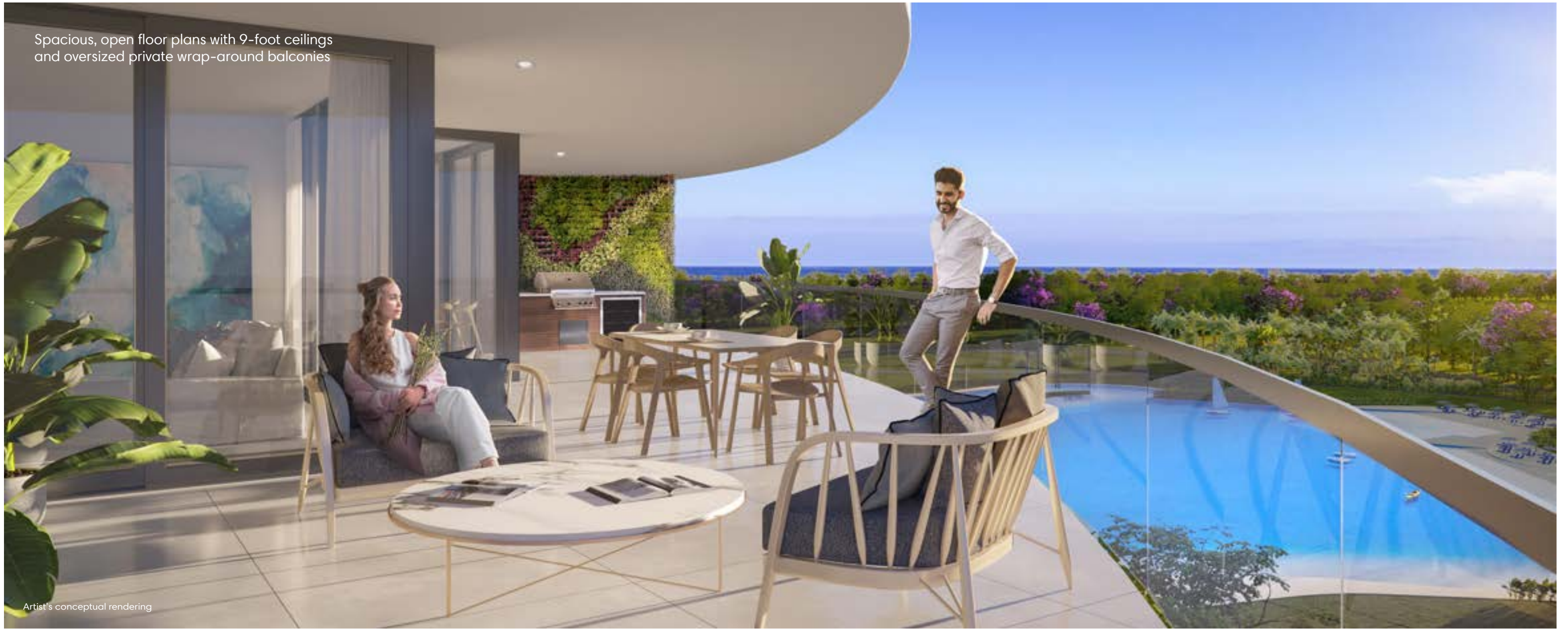
Artist's conceptual rendering

Spacious, open floor plans with 9-foot ceilings and oversized private wrap-around balconies