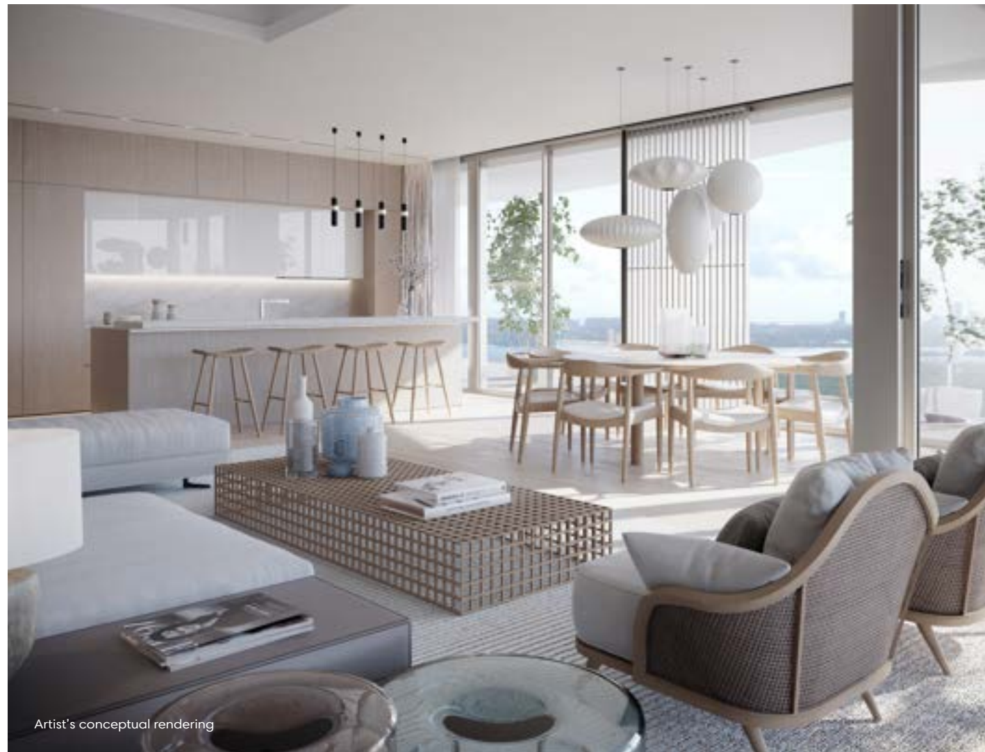
Artist's conceptual rendering