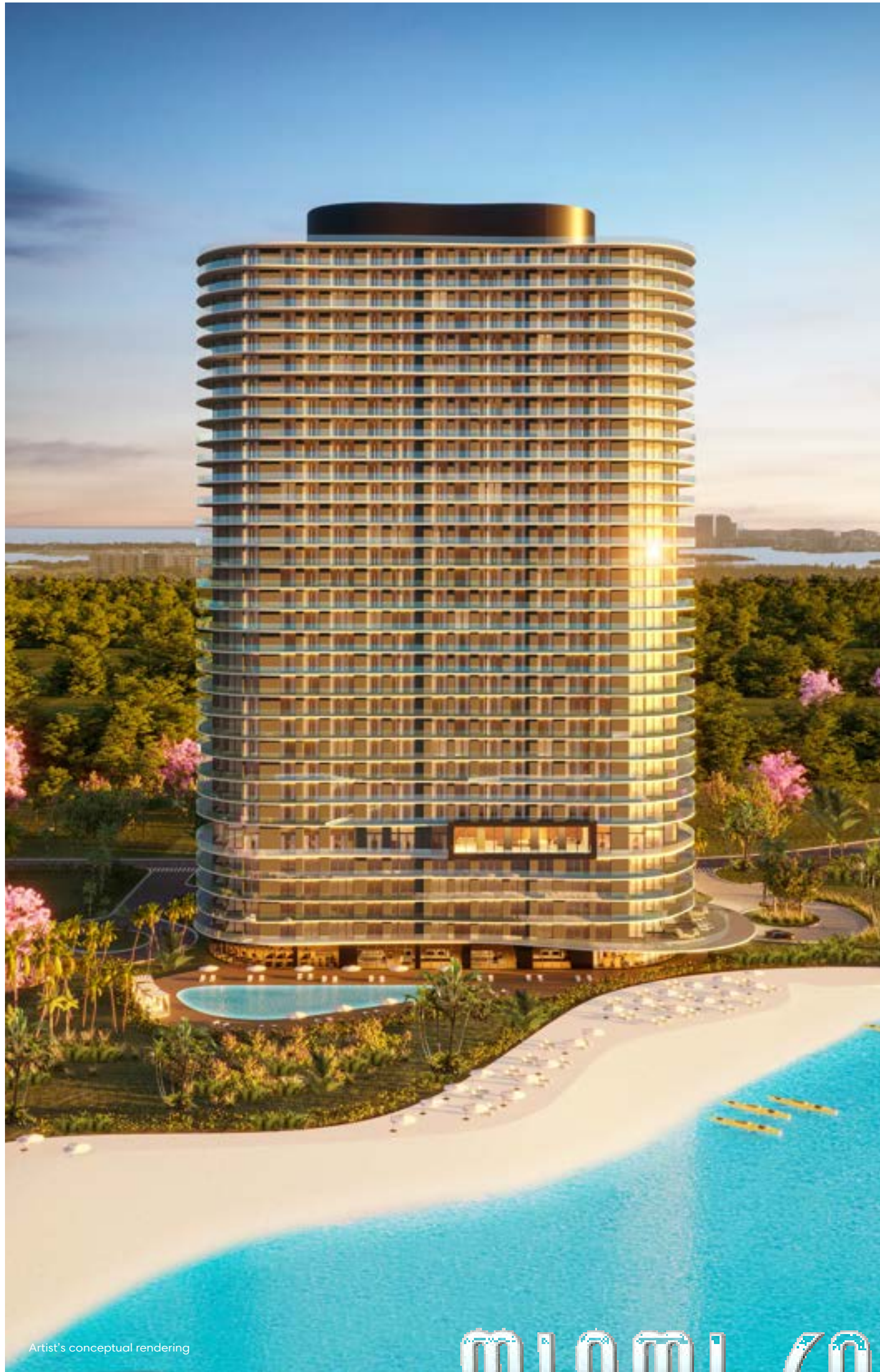
Artist's conceptual rendering