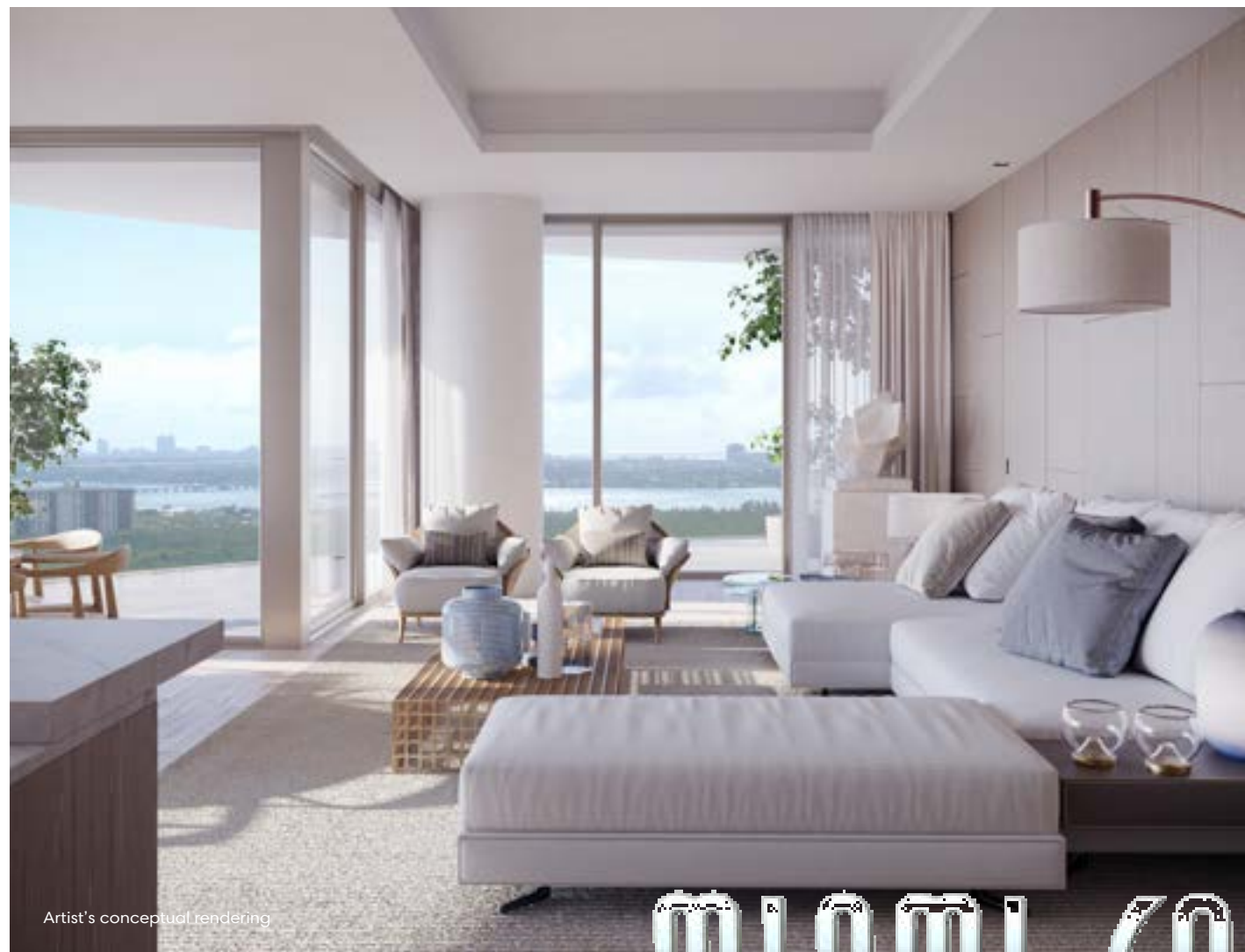
Artist's conceptual rendering