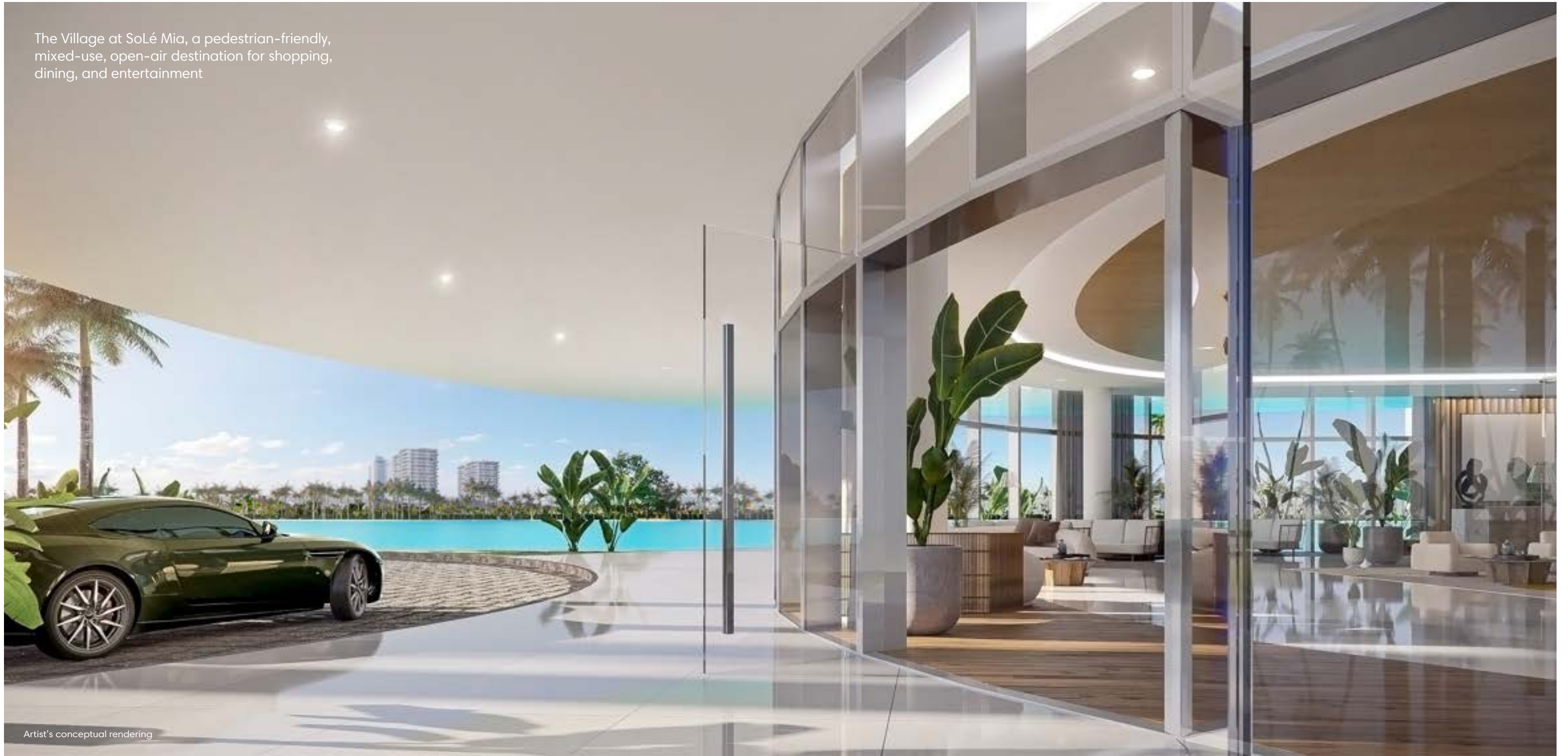
Artist's conceptual rendering

The Village at SoLé Mia, a pedestrian-friendly, mixed-use, open-air destination for shopping, dining, and entertainment